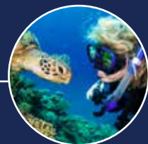
Second snorkel and dive site