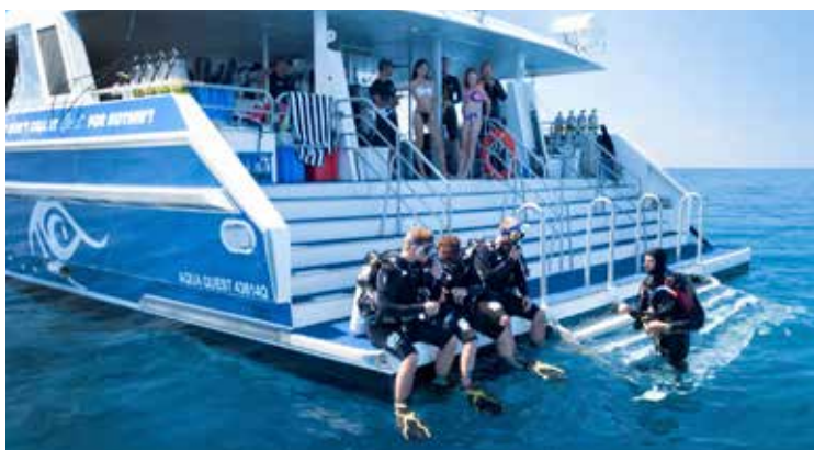
Full briefing and skill session before your introductory dive

Introductory Diving requires minimum age of 12, and a successfully completed medical declaration. Price is per person. Includes instruction and all scuba equipment. Underwater photographs of your experience can be purchased separately.