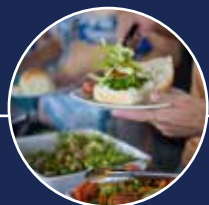
Delicious tropical buffet lunch