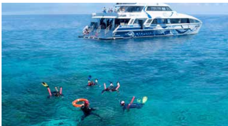
Perfect way for families to spend the day

Child ages are 4–14 years. Includes instruction snorkelling equipment, and life-jackets/flotation devices if required. Underwater photographs of your experience can be purchased separately.