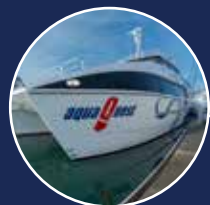
Check in at 8am Cairns Marlin Marina