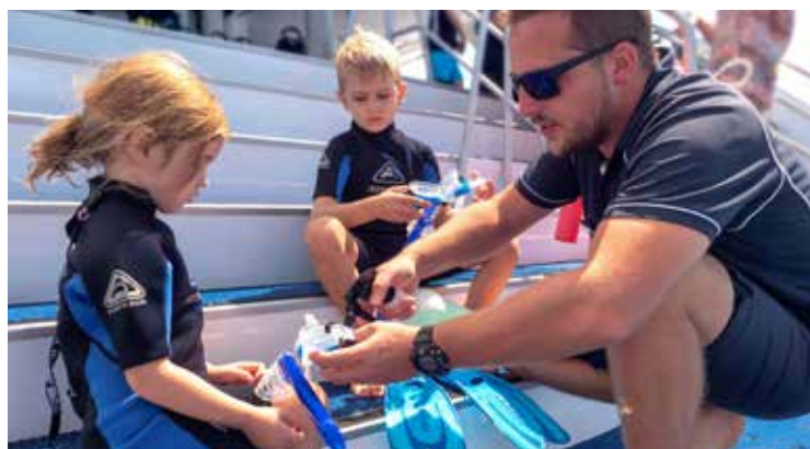
In-depth equipment tuition and briefing