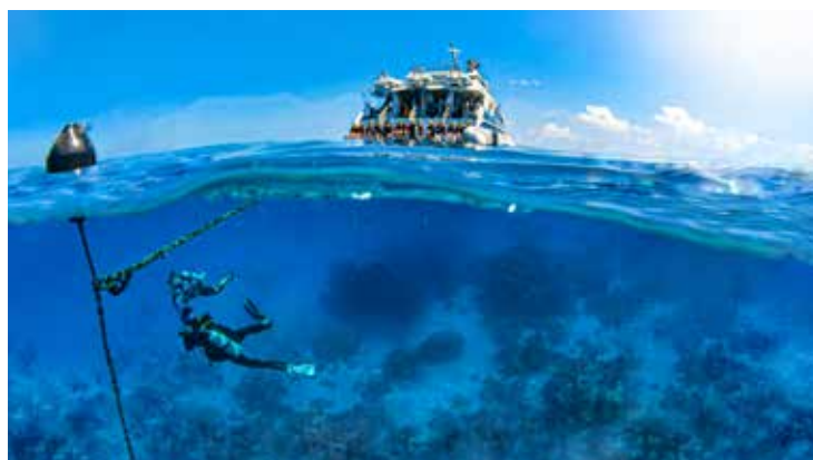
Explore hidden areas on the reef with a private instructor*

Includes all scuba equipment. Please bring your certification card. If you have not dived in over 12 months, we will need to witness a set of 3 basic SCUBA skills underwater first.