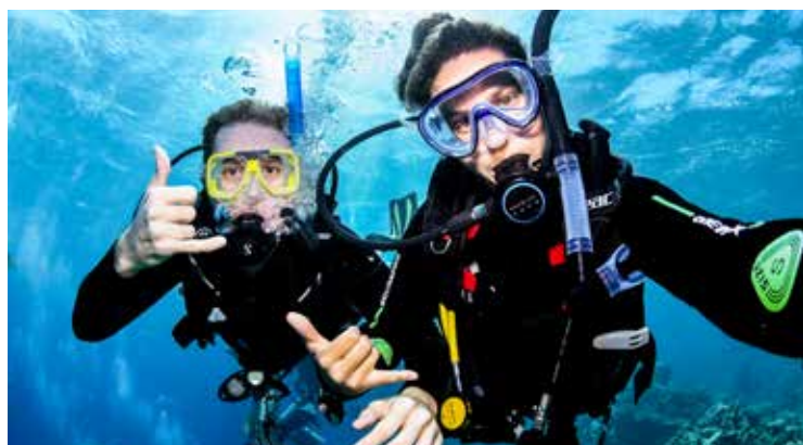
Receive a PADI Certificate of Achievement