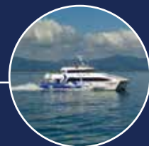
Return to Cairns approx. 4:30pm