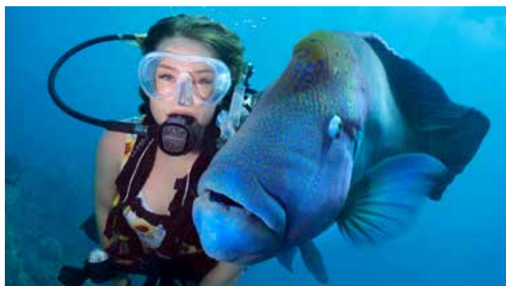
Dive with your buddy or upgrade to a guided dive