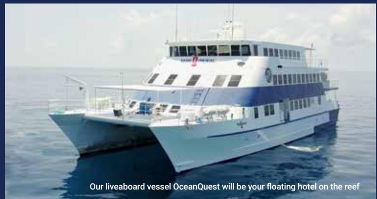
Our liveboard vessel OceanQuest will be your floating hotel on the reef