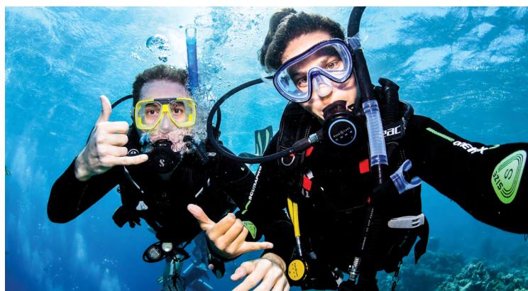
Receive a PADI Certificate of Achievement