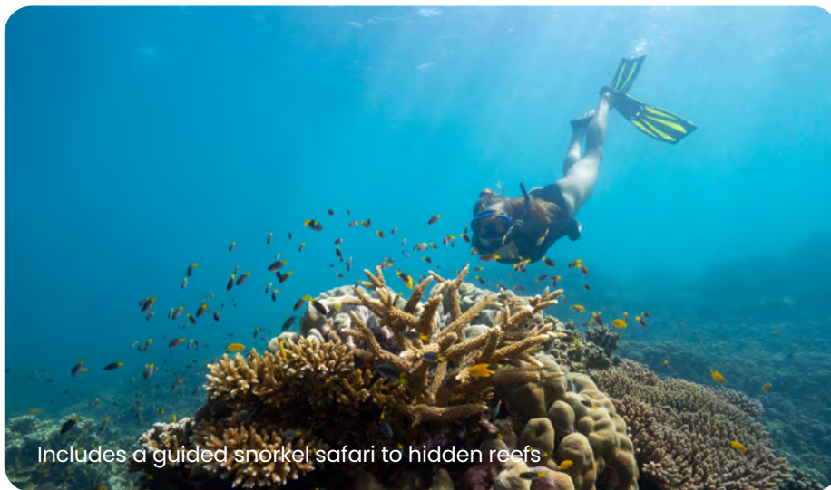
Includes a guided snorkel safari to hidden reefs