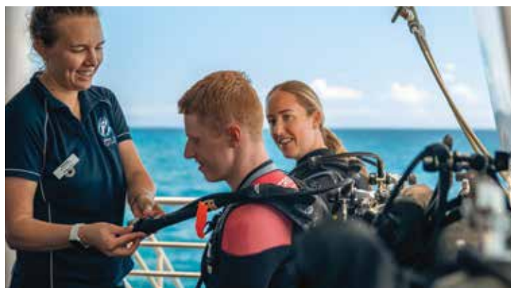
Explore hidden areas on the reef with a private instructor*

Includes all scuba equipment. Please bring your certification card. *Guided Groups are a maximum of 8 divers. If you have not dived in over 12 months, we will need to witness a set of 3 basic SCUBA skills underwater first.