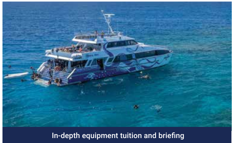
In-depth equipment tuition and briefing