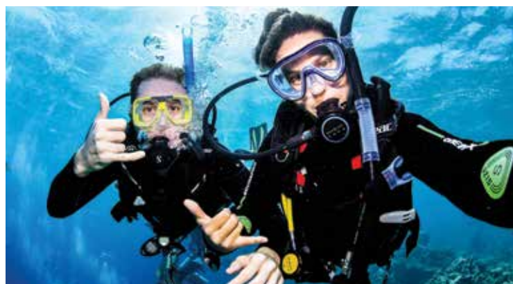
Receive a PADI Certificate of Achievement