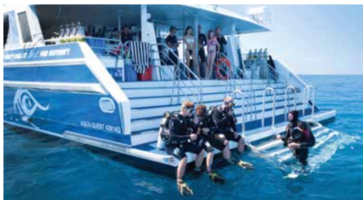
Full briefing and skills session before your introductory dive

Introductory Diving requires minimum age of 12, and a successfully completed medical declaration. Price is per person. Includes instruction and all scuba equipment. Underwater photographs of your experience can be purchased separately.