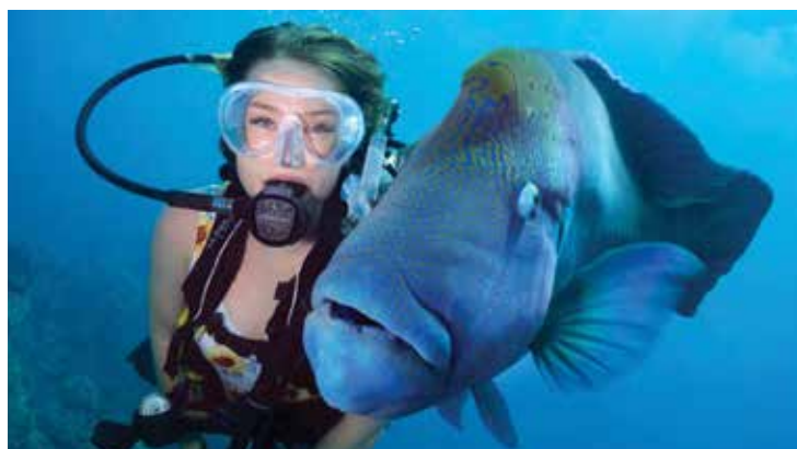
Dive with your buddy or upgrade to a guided dive